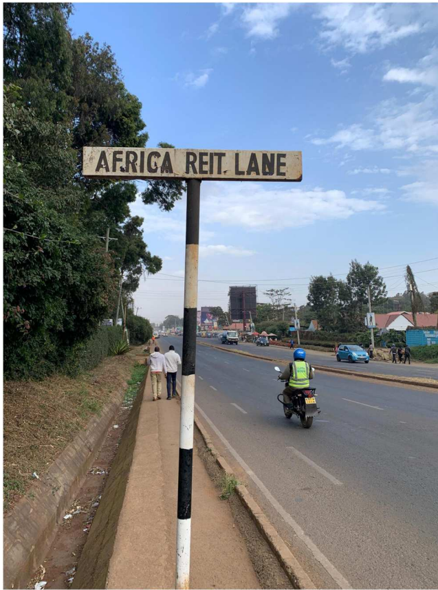
Figure 1. Photo by Kevin Donovan, 2023.

Readers of this journal are likely to know what the acronym REIT stands for: real estate investment trust, a (perhaps once) obscure financial instrument created by the United States government in the middle of the twentieth century. The law that created these REITs aimed to offer the ‘investing public’ 1 opportunities to participate in real estate markets from which they were previously excluded. Lawmakers thought REITs would lower the capital barriers to real estate investment and allow American citizens to reap the financial rewards of landlordism.