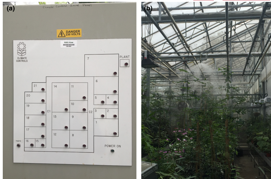
FIGURE 3 Climate security in the private tropical nursery.

engineer, February 2022). 4 Obtaining these desired values requires an astronomical clock and latitude inputs, so the system knows when sunrise is precisely at Kew ('in Birmingham there might be five minutes' difference'), and then a host of meteorological data (outside temperature, radiation level, wind speed, rainfall) that affects internal conditions and that are therefore monitored in real-time: