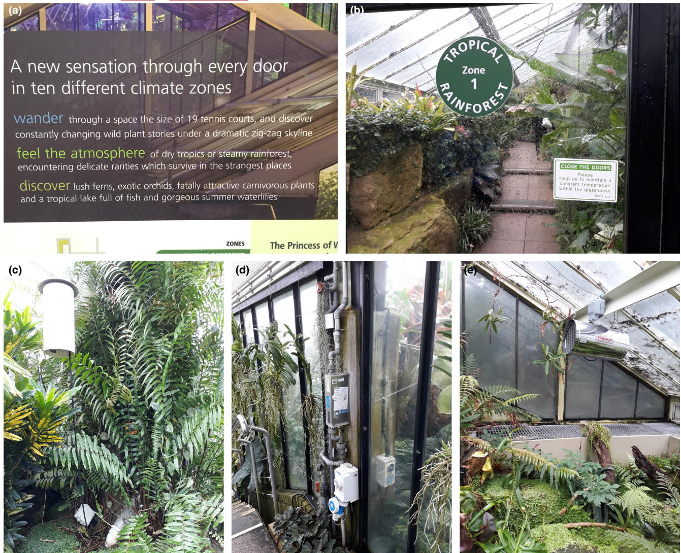
FIGURE 1 Climate simulation in the Princess of Wales Conservatory (Source: photos by authors).

Thus, more precise digital control became central to creating these more realistic and multiple environments through early use of automation and climate simulation systems, which also reinforced the justification for ex-situ plant collections: