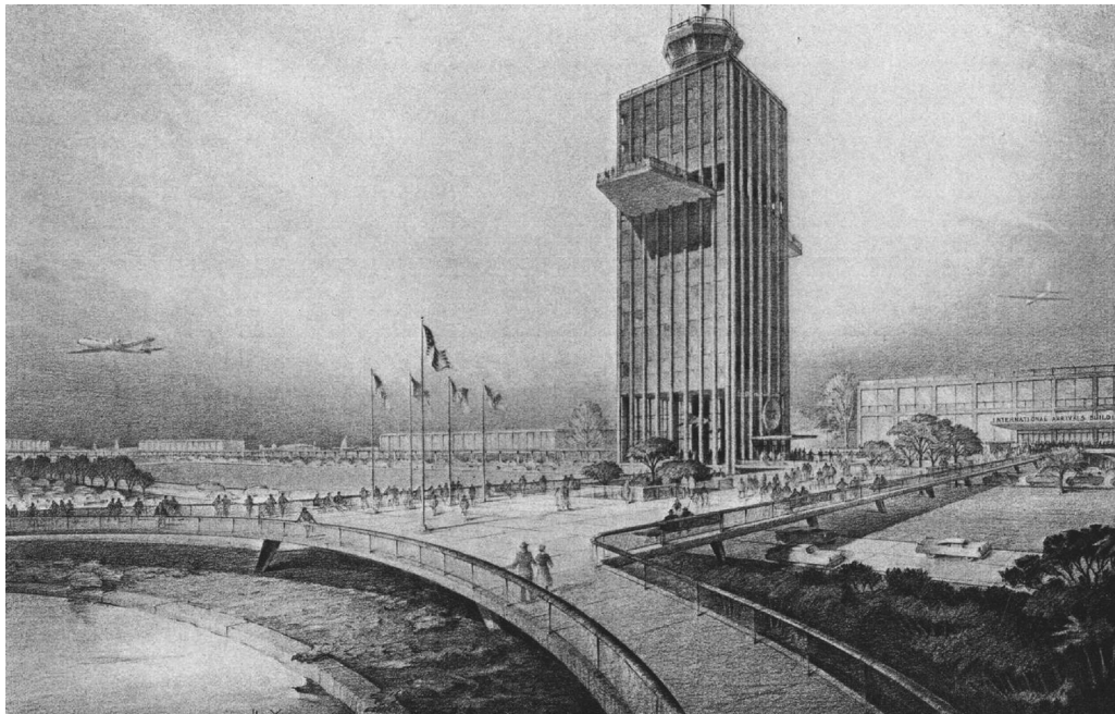
Figure 2. Terminal City, Preliminary design for Idlewild Airport, New York, Port of New York Authority, Rendering by Hugh Ferriss, 1955. Courtesy Avery Architectural and the Fine Arts Library, Columbia University in the City of New York.

of the building. 12 Unfortunately, the day after the opening night, it was to last only one minute, as the Port Authority decided to close it down for safety reasons. Whatever the reasons for this interruption, this new critical episode again indicated the failure to activate new potentials for the Terminal. 13 (Fig.2)