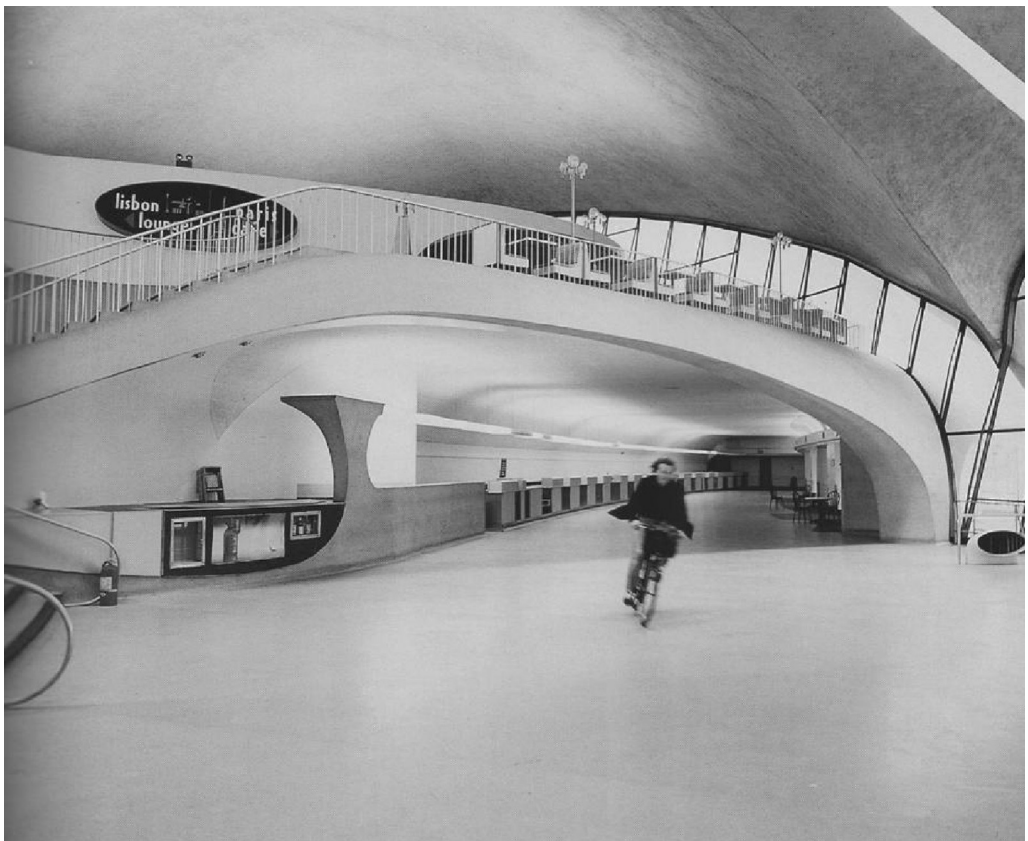
Figure 4. Terminal 5 exhibit, 2004.