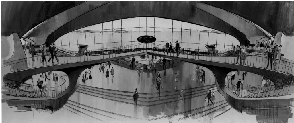
Figure 1. Rendering for Trans World Flight Center, Idlewild (Now JFK) Airport, New York.

The striking nature of this building relies in its ability to represent a total architecture, where each part is organically the consequence of the next. 3 The structure of the building is sculptural, one and indivisible, envelope, façade and floor all together. It demonstrates technological innovations like travellers, dynamic screenings or new optical illusions like oblong tunnels. The challenge was also to create for TWA a corporate building that would be distinctive and memorable given the fierce competition among air companies. Like his other commissions in the fields of automobile, television or computer manufacture, Saarinen sought “a style for a job” and considered his clients, whose influence on the mass culture would be determining, as co-designers. 4