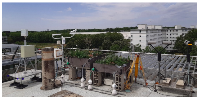
Figure 1. (left) Radar tower from which a dual polarization X-band radar, a Parsivel, a meteorological station (including the mini vertically pointing Doppler radar) and a 3D sonic anemometer are operated. (right) Picture of roof of the building from where (from left to right) 3D-Stereo, PWS100 and two Parsivel2 are operated.