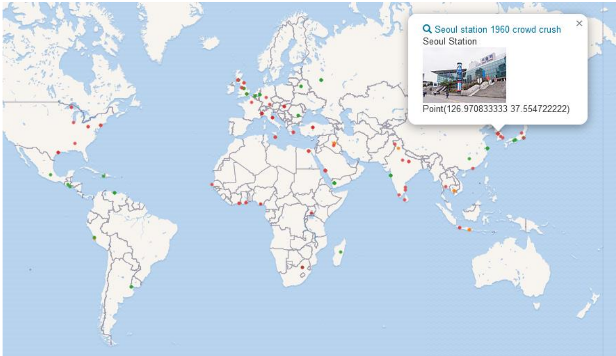
Figure 1: cartography of crowd crushes listed on Wikidata, September 2023.