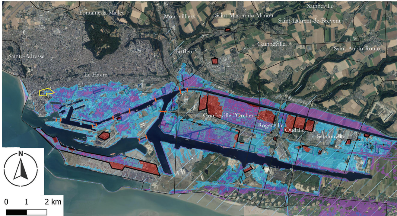
Figure 1: Multi-risk approaches to urban networks in the Havre urban conurbation