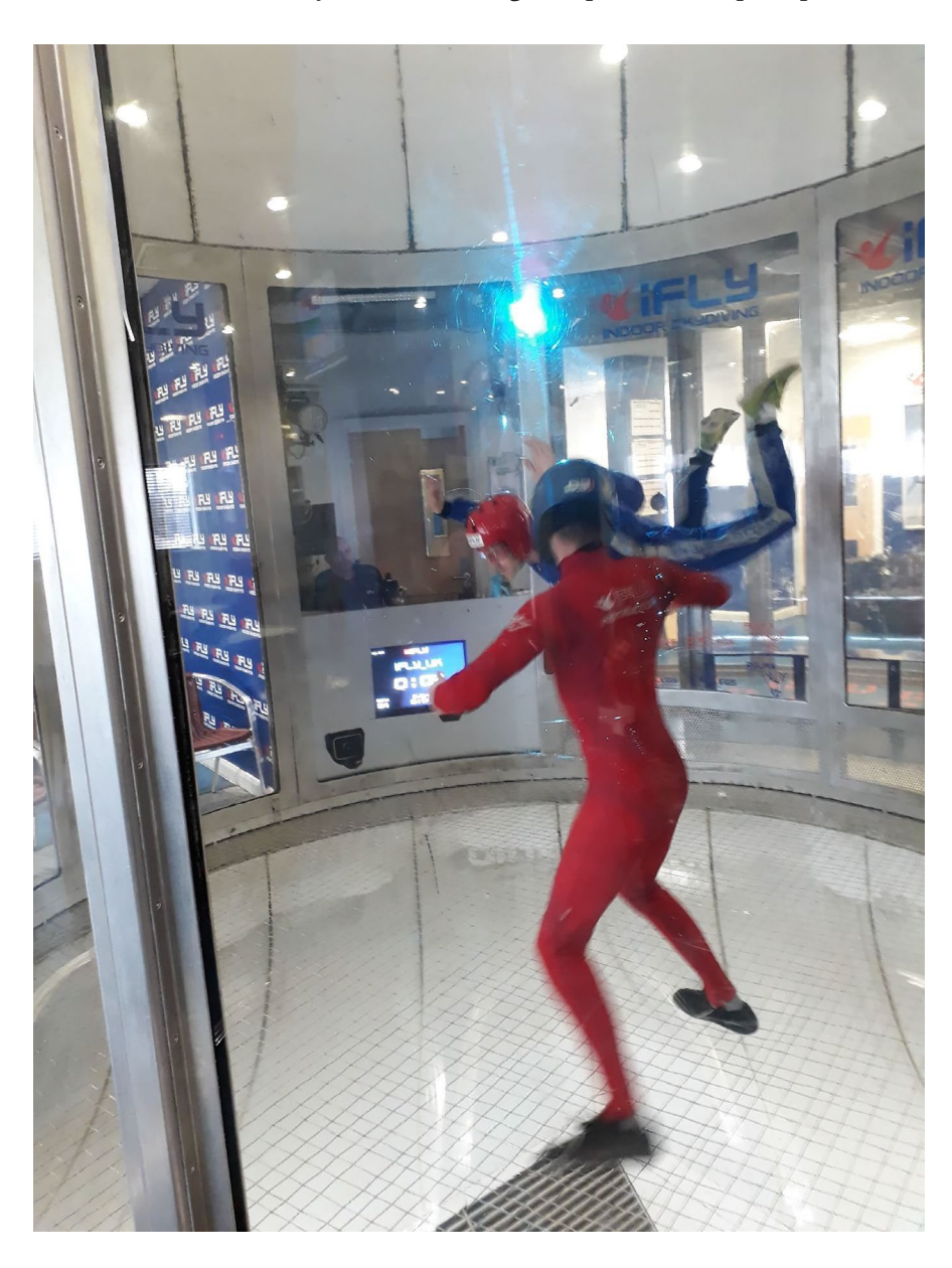
FIGURE 1 iFly wind tunnel chamber

Vertical wind tunnels were initially developed in the 1920s in aeronautical research to test aircraft and the operation of parachutes (Brigg, 2016). The earliest recorded use of a human flying in a wind tunnel was in 1964 at Wright-Patterson Air Force base in Dayton, Ohio, when Jack Tiffany, who was testing the operation of Apollo parachute clusters, successfully