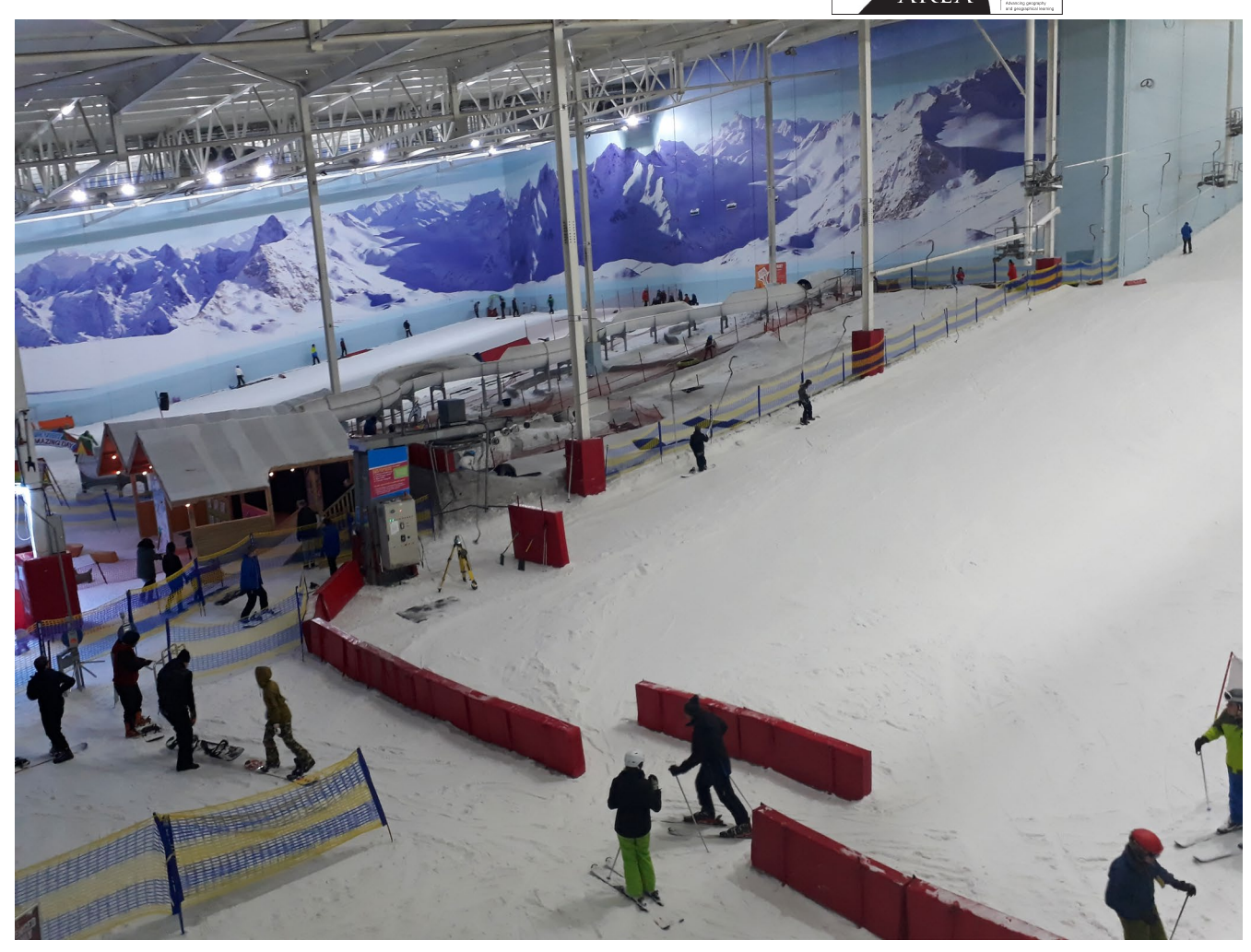
FIGURE 2 Chill Factor<sup>e</sup>