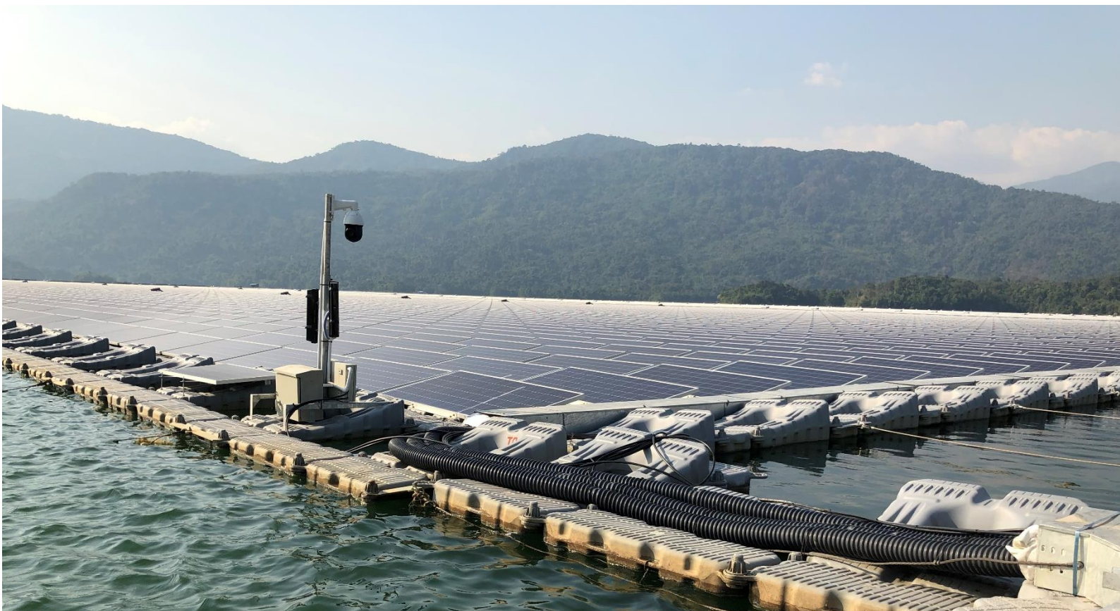
Da Mi floating solar.

The renewable energy boom has demonstrated that a 5-year planning update cycle does not match the timescale of today's changes in the energy system. Solar PV gained a 25% share in the capacity mix in two years. We can expect more rapid advances in decentralized energy production. The draft PDP8 proposes to give additional responsibilities to the National Steering Committee for Electricity Development in Implementation of the PDP 8 (conclusion 19.11) and to allow power planning on a one or two years cycle as a basis to organize bidding and choose investors for power projects (conclusion 19.12). These recommendations about regulatory changes are more critical than long term forecasts.