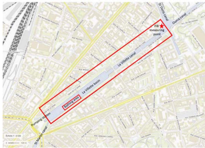
Figure 1 - Study area (map Geoportail). The red star indicates the location of water sampling for BIF measurements

precipitation, solar radiation, wind velocity and direction, nebulosity) were measured at the Météo France station of Orly airport. During 2017 summer, a bi-weekly monitoring of E.coli concentration was conducted at the upstream sampling station (Figure 1) by Mairie de Paris (Vanhalst, 2017).