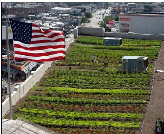
Fig. 3 Brooklyn Grange, Urban rooftop farm, New York.

As they are sometimes called, “living roofs” are alive and can interact with their environment. If this technique is used at a wider scale in coming years to refresh cities (Figure 3), it is important to check whether they could induce some environmental or public health inconveniences.