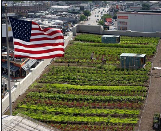
Fig. 3 Brooklyn Grange, Urban rooftop farm, New York.

As they are sometimes called, “living roofs” are alive and can interact with their environment. If this technique is used at a wider scale in coming years to refresh cities (Figure 3), it is important to check whether they could induce some environmental or public health inconveniences.