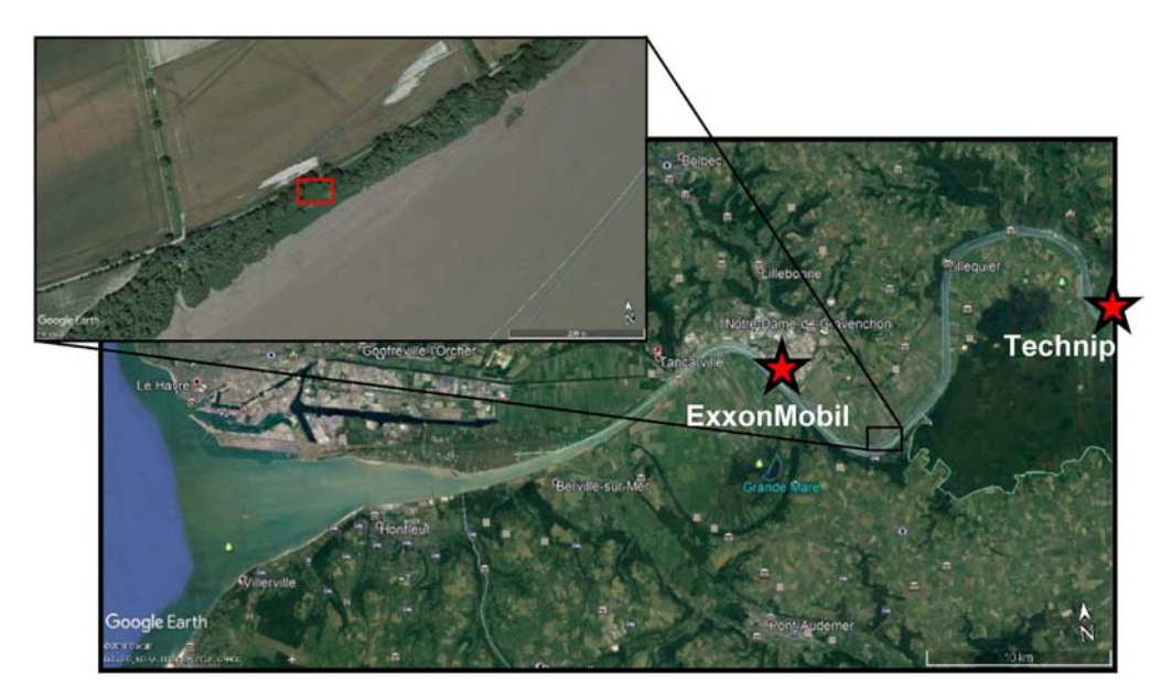
Fig. 2. Geographical localization of the sampled site. Notice that plastic producers from Notre-Dame-de-Gravenchon are close to the targeted site. Lat. 49.4339; Long. 0.6160. The red stars point to the major plastic manufacturers, i.e. main sources of preproduction pellets.