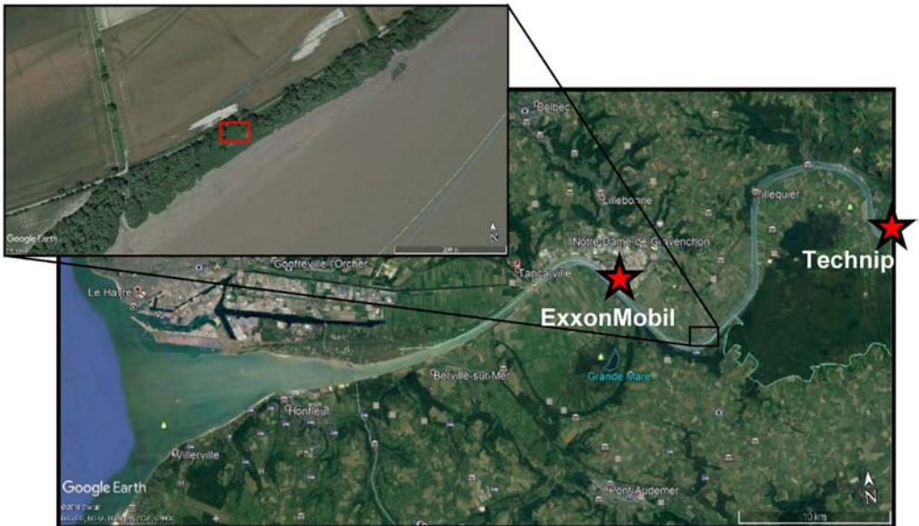
Fig. 2. Geographical localization of the sampled site. Notice that plastic producers from Notre-Dame-de-Gravenchon are close to the targeted site. Lat. 49.4339; Long. 0.6160. The red stars point to the major plastic manufacturers, i.e. main sources of preproduction pellets.