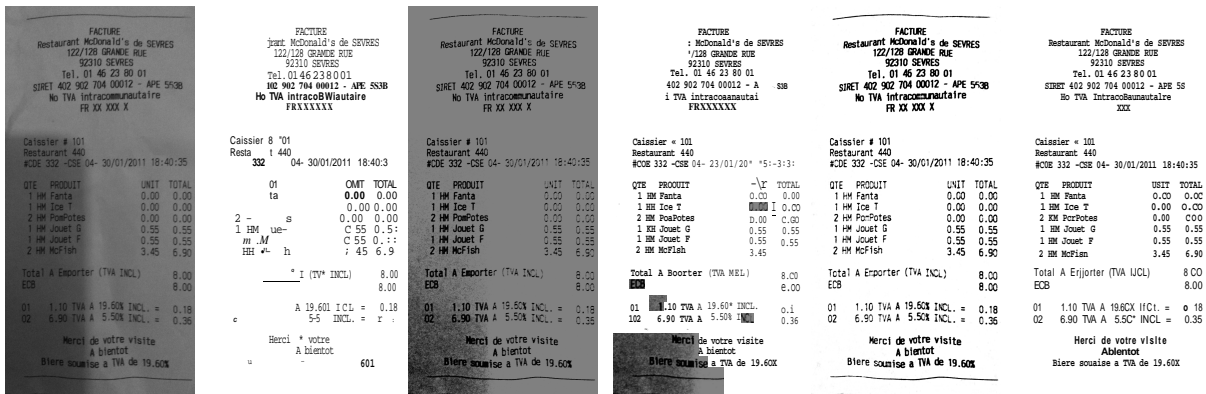
(a) Example original image (b) Recognition by a classical OCR software ; estimated original image model 7 (c) Text enhance-ment by a classical OCR software ; reflectance ; model 7 (d) Recognition by a classical OCR software ; estimated re-reflectance ; model 7 (e) Text enhance-ment by a classical OCR software ; reflectance ; model 11 (f) Recognition by a classical OCR software ; estimated re-reflectance ; model 11