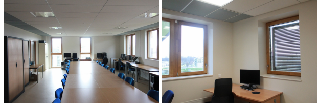
Figure 3. Left: Meeting-P31. Right: Trapezoid-P17 (non Manhattanness can be seen on the ceiling at the room corner).

We first varied the inaccuracy of line segment detection from \sigma_{detect} = 0 to 5 pixels, keeping the planarity noise at \sigma_{planar} = 0 , then at 20 mm. We also varied the planarity level from \sigma_{planar} = 0 to 50 mm, keeping the inaccuracy of line segment detection at \sigma_{detect} = 0 , then at 2 pixels. In both cases the error of scale ratio estimation degrades