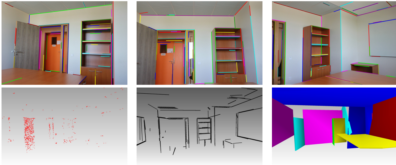
Figure 1. Top row: 3 consecutive views of the Office-P19 dataset, with detected line segments. Bottom row: views of this area with reconstructed structures: points (left), lines (middle), bounding boxes of planes associated to clusters of coplanar lines after BA (right).

and difficult interior scenes with little overlap and little texture, we validate empirically our technical choices and we show (1) that we can calibrate images that cannot be calibrated with existing point- or line-based SfM methods, and (2) that our accuracy is on par with state-of-the-art SfM methods on less hard datasets.