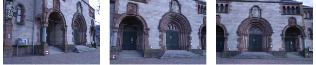
Figure 5. Only our method can calibrate the very wide baseline and viewpoint change of Herz-Jesu-P3 (furthest 3 images in P8).