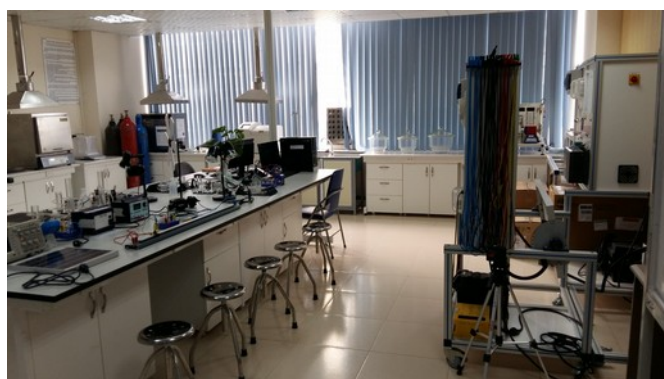
Illustration 2: CleanED lab in USTH room 610, October 2015.

Setting up a lab's information infrastructure is as important as the physical infrastructure. We used a mix of solutions, mostly in the cloud and external from the University. Domain, web and blog hosting are purchased from a commercial provider, Gandi. For file sharing we use Dropbox. The 2Gb storage capacity of the free plan is not enough for our needs already. For email, agenda, collaborative document editing, and mailing list we use Google. Both the price and quality are the best possible, but this was a choice dictated by