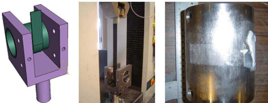
Fig. 2 - From left to right: diagram of the test device for curved joints, picture of the experimental set-up, and photograph of a specimen after fracture showing the marking of the steel by the friction zone.

A specific test apparatus, shown in Fig. 2, was designed. This can be used to test both the lap and curved assemblies while ensuring that the composite adherent remains aligned with the axis of the testing machine. A 100 kN tensile testing machine operating with a constant rate of displacement of 2 mm/min was used.