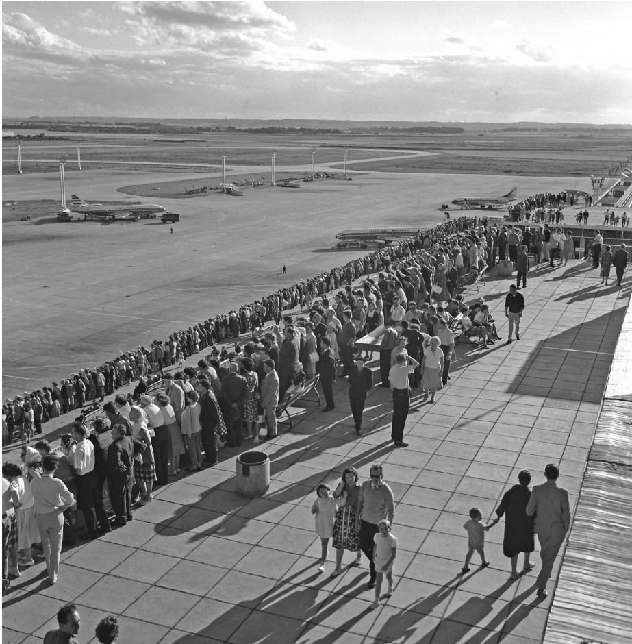
[12.4] Orly Airport, observation terraces, early 1960s.

very first aeronautical shows – became enhanced by the airport experience. The great airports that had been built in the 1930s proffered the choreography of planes moving on the ground. Le Bourget, LaGuardia, Tempelhof – all of them designed or considerably renovated before World War II and the rapid expansion of commercial aviation – were fitted with observation decks that recalled the pageantry of the epic air rallies. Here, the parallel with the imaginary seemed tangible. The airport viewing platform was a legacy both of the public rally stands from which the spectacle on the ground was surveyed and of fantastic high-level balconies from which the city could be seen from above.