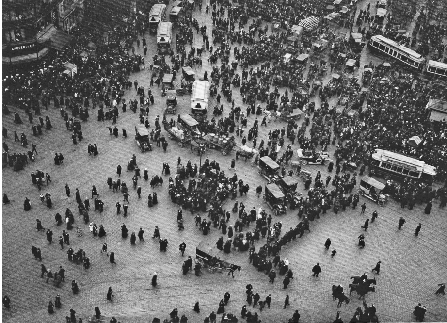
[12.1] Léon Gimpel, 'The Parisian Crowd in the Place de la Bastille', 27 February 1913.

friends, but – inspired by the new times, those of a spatial revolution that celebrated vertigo and instability – had aimed at a reconfiguration of reality.