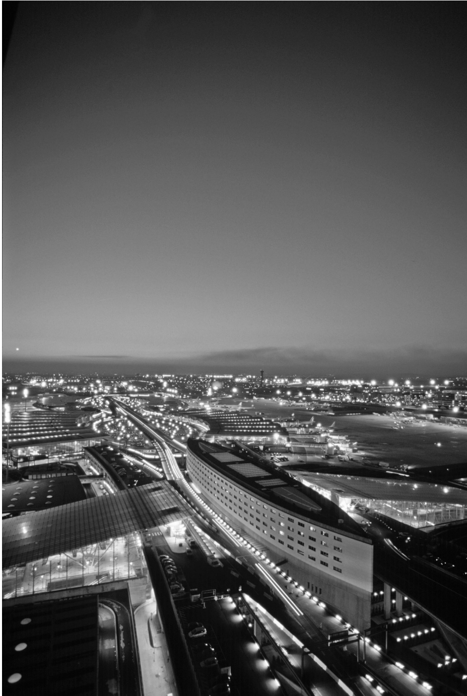
[12.5] Roissy 2, 2003.