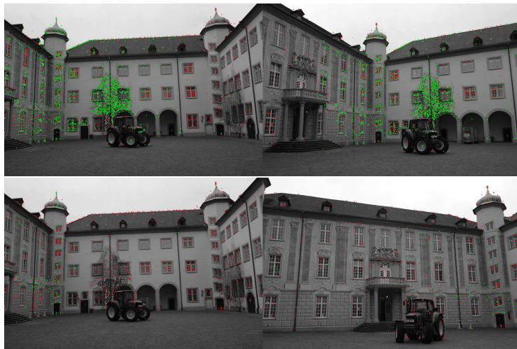
Fig. 2. Pairs (0,1) on top and (0,4) on bottom of the used Strecha’s Castle-P19 sequence. For visualization purposes, the data matches were classified as inliers (green) and outliers (red) using an arbitrary threshold of 3 pixels on groundtruth errors.

Evaluation errors (see Section 4) are shown in the last 4 columns of Table 2. Pair (0,5) is not reasonably solved on average by any of the methods, although occasionally all of them found a good solution. We highlight in bold the best results among the three non-parametric methods (ORSA, Hiso, Hani) excluding RANSAC, but at the same time we keep the RANSAC output in the table for the reader to see the sometimes dramatic effect of parameter selection. According to our preliminary experiments, ORSA gives slightly better average results than our proposals for medium-to-high inlier ratios, being worst on average otherwise, depending on the feature distribution – see for instance results on pair (0,4).