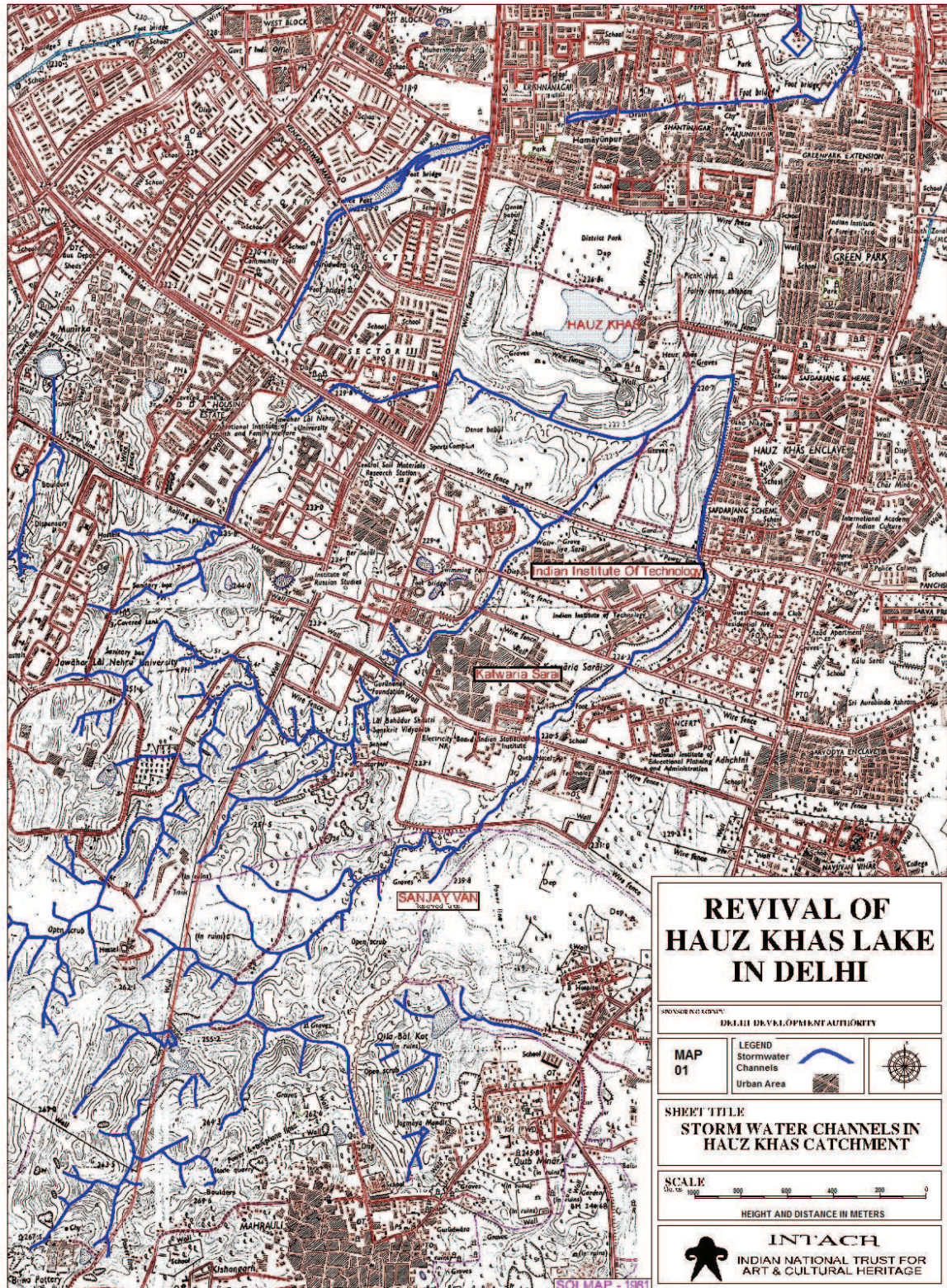
Map 1: Revivals of Hauz Khas lake in Delhi: storm water channels in Hauz Khas catchment