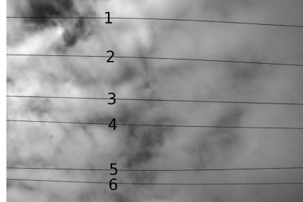
(a) distorted image