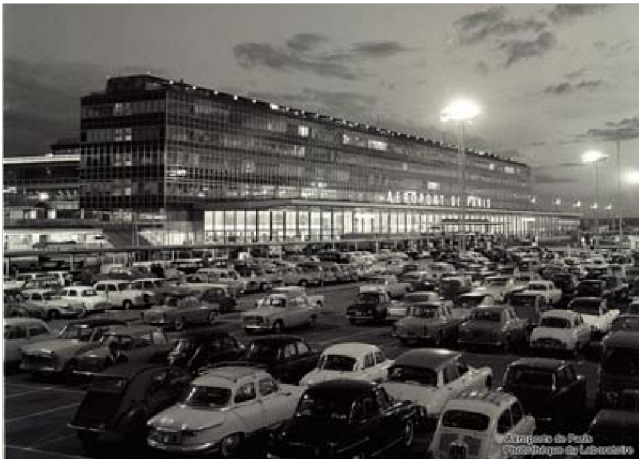
Figure 4. Orly Sud, Paris, The airport Megastructure , 1963.

While this process of increasing institutional autonomy for airports was not as pronounced in Paris as in other major capitals, 38 it still marked out airports' emergence as a world per se, particularly as they began to take up residence outside of the limits of the host city. From then, the emergence of airports outside of the city walls was to boost reflections on urban matters around what would soon be known as "air cities." With their outside dimensions—as reflected in the numerous parallels drawn between the dimensions of projected airports and their host cities—airports became testing grounds for unbridled suburban experimentation as city boundaries experienced unprecedented growth. 39 New York's new Idlewild Airport, fully operational from 1958, was known as Terminal City , the urban concept of which was designed by Hugh Ferriss and Wallace K. Harrison, Chief Urban Planner for the United Nations New York headquarters. Idlewild (renamed after slain President John F. Kennedy in 1963) was monument, showcase and event, all in one. 40 Paris's Orly Sud megastructure, inaugurated by General De Gaulle in 1961 and designed by Henri Vicariot and Jean Prouvé, deployed a radically new glass structure