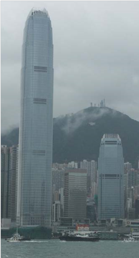
Figure 6. Hong Kong. View of the Central Airport Express Station dominated by the highest skyscraper of the city, 2005

them and the airport. Designers and city planners have constantly strived to compress or even ignore this intermediate space between the two attracting poles in order to counter the effects of placing the airport in exurban space. High-speed transportation infrastructures play a key role in this constant quest for suppressing this physical distance and ignoring the intermediate space between the city and the airport. These could include either unrealized projects such as the aérotrain —designed by the engineer Jean Bertin and originally proposed in the mid-1960s to link some strategic new suburban nodes, including airports, 48 or actually deployed projects such as the 250km/hour Shanghai-Maglev magnetic levitation train—now operational since 2003 from Pudong to the airport. The “hide-thathorrible-suburb-so-we-don’t-have-to-see-it” reaction prevalent around