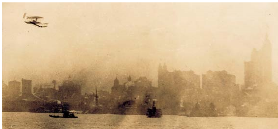
Figure 1. Last Wilbur Wright flight in New York, during the Hudson-Fulton celebrations, October 4, 1909.