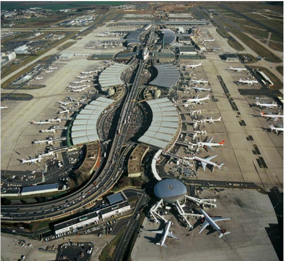
Figure 5. Aerial view of Roissy Terminal 2, Paris, 2005.

Consequently, the construction of the Roissy 2 terminals was subject to new considerations. 46 The sequential pattern according to which this string of air terminals was built between 1982 and the present was a result of both the investment difficulties experienced by Aéroports de Paris