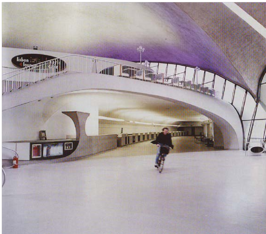
Figure 7. Terminal 5 exhibit, Eero Saarinen TWA terminal, New York, 2004

Roissy Airport, on the other hand, cultivates a stratification approach that has tended towards accumulation. Construction and renovation has proceeded over a thirty-five-year period that has witnessed the changeover from elite to mass passenger transport and the creation of an exurban territory followed by the airport’s re-absorption into the regional Greater Paris. This development has also produced a highly