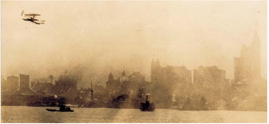
Figure 1. Last Wilbur Wright flight in New York, during the Hudson-Fulton celebrations, October 4, 1909.