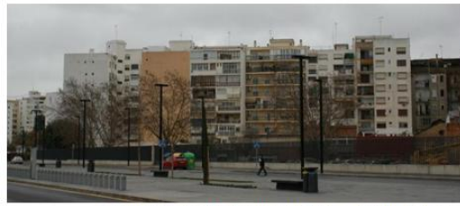
Jesús district, in front of Joaquín Sorolla station

prices and current residents, if their property's value appreciates, will gain. But this point of view doesn't take into account the question of the tenants, who couldn't support increased rates. Thus a strong social deficit is felt in the project.