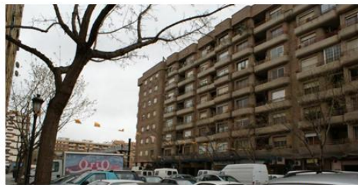
Jesús district, near the footbridge upon the tracks, © E. Libourel, 2011