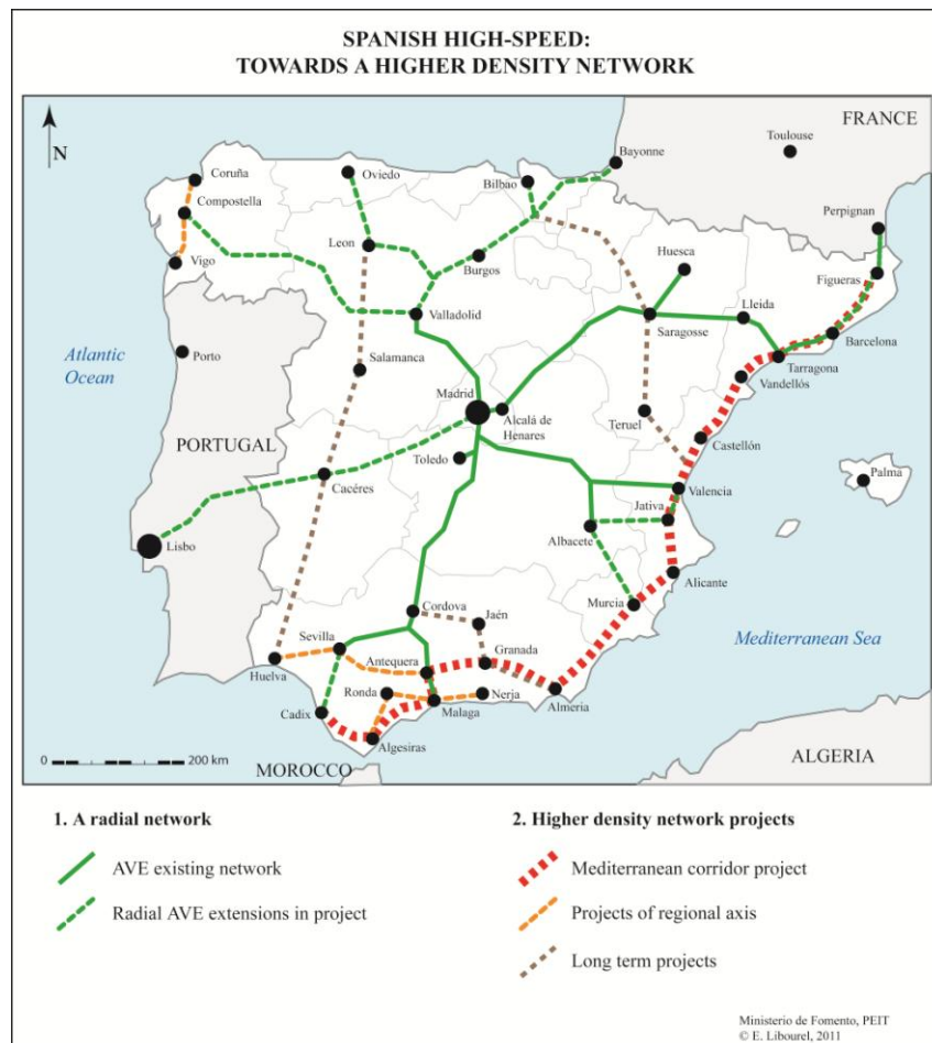
Map 1- Spanish high-speed rail networks

The project of a Mediterranean corridor, part of the TEN-T (Trans-European Networks of Transport) and connecting coastal cities together is the other axis which would give Valencia a nodal position. This axis was in March 2011 declared a priority for the Spanish government. The missing portion of high-speed railway between Tarragona and Castellón should be the first part of it to be built. The urban and regional political actors had a very strong action towards the government and the European Commission to have this Mediterranean axis added to the TEN-T, which was decided in November 2011.