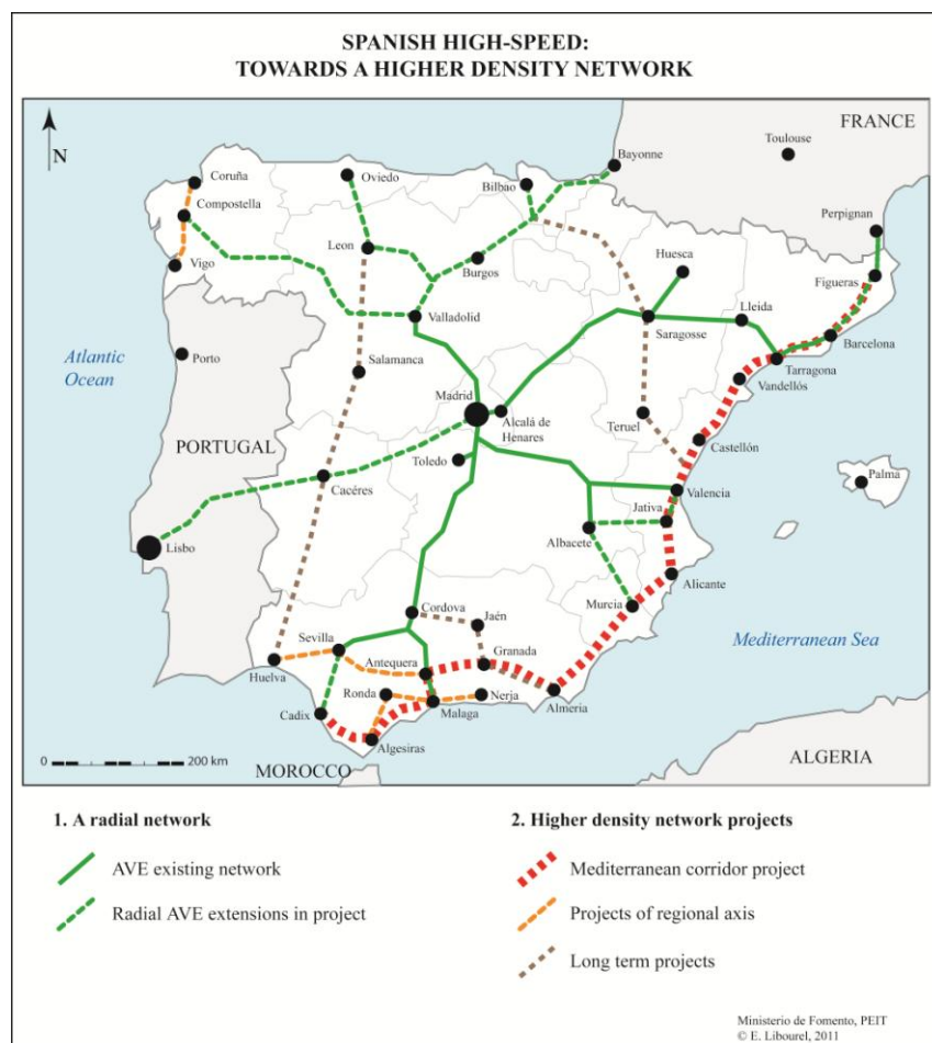
Map 1- Spanish high-speed rail networks

The project of a Mediterranean corridor, part of the TEN-T (Trans-European Networks of Transport) and connecting coastal cities together is the other axis which would give Valencia a nodal position. This axis was in March 2011 declared a priority for the Spanish government. The missing portion of high-speed railway between Tarragona and Castellón should be the first part of it to be built. The urban and regional political actors had a very strong action towards the government and the European Commission to have this Mediterranean axis added to the TEN-T, which was decided in November 2011.