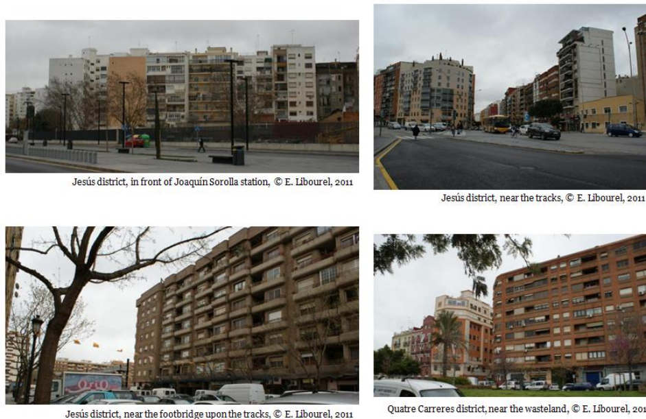
Picture 2- Jesús and Quatre Carreres districts

prices and current residents, if their property's value appreciates, will gain. But this point of view doesn't take into account the question of the tenants, who couldn't support increased rates. Thus a strong social deficit is felt in the project.