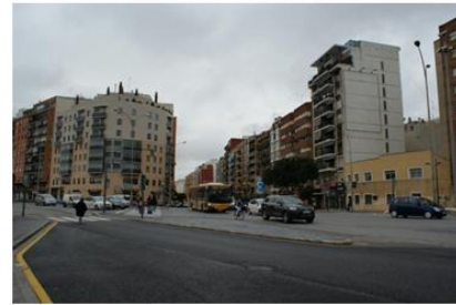
Jesús district, near the tracks, © E. Libourel, 2011