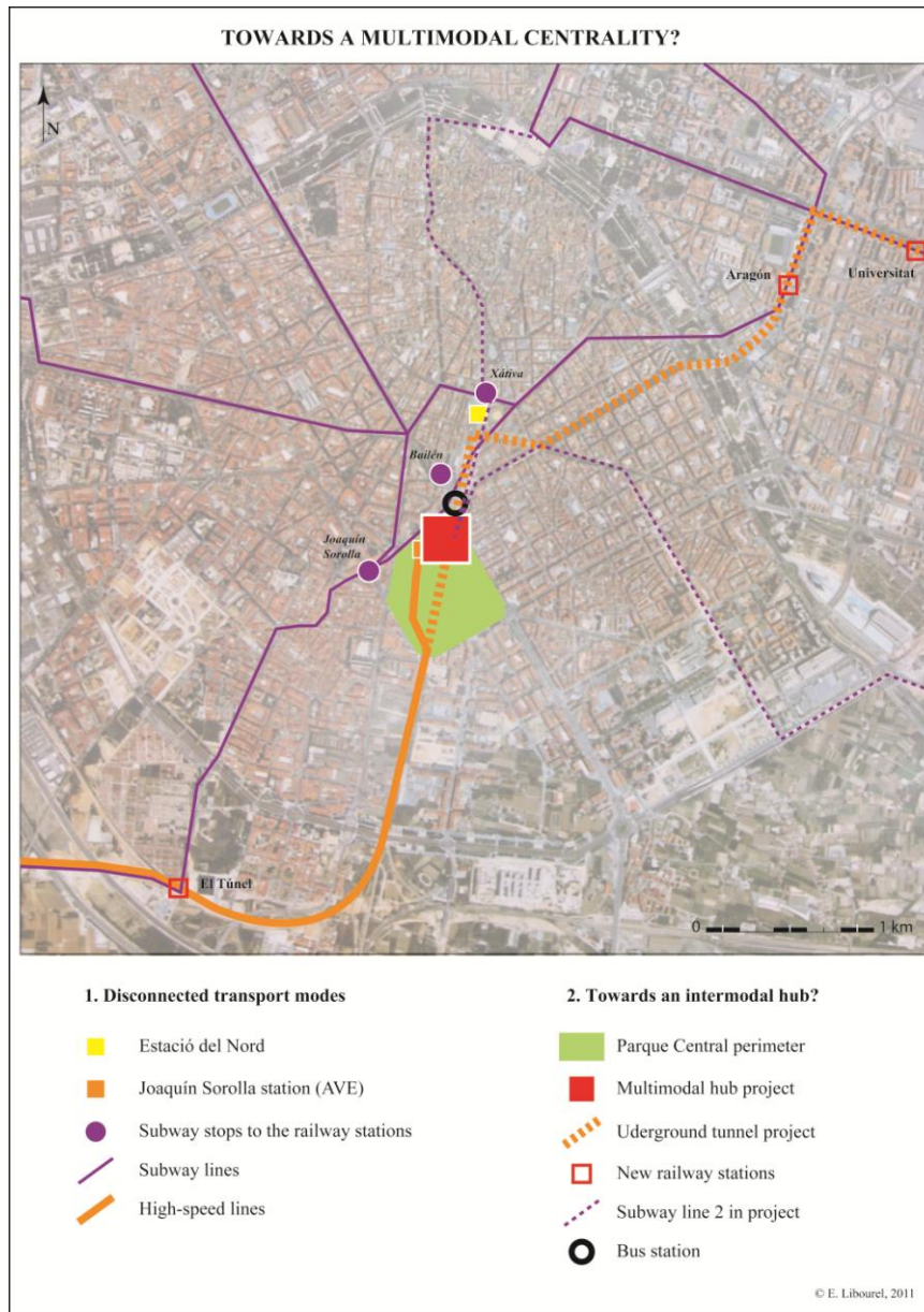
Map 4- Parque Central and its incomplete connection to urban networks

Concerning the transportation aspect of Valencia Parque Central, some lacks can be noted both at infrastructural and conception levels. To be able to receive the AVE in 2010, Valencia built Joaquín Sorolla station, with European gauge tracks. This new station is located on the south of the Estació del Nord, 700m away. It is made of reusable materials because it is supposed to be demolished as soon as the new underground central station will be in operation. For now, the AVE reaches in a disconnected station, far away from the centre, from the conventional station and from any public transport. Moreover, neither the representatives of Valencia Parque Central society, or the regional delegate of ADIF and the town planning services, seem to be able to provide details about the future station and its technical aspects. Even the most trivial of them are occult: how many tracks, how many floors in the basement, which interconnection with the subway system, what room for shops and services?