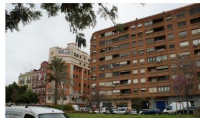
Quatre Carreres district, near the wasteland, © E. Libourel, 2011