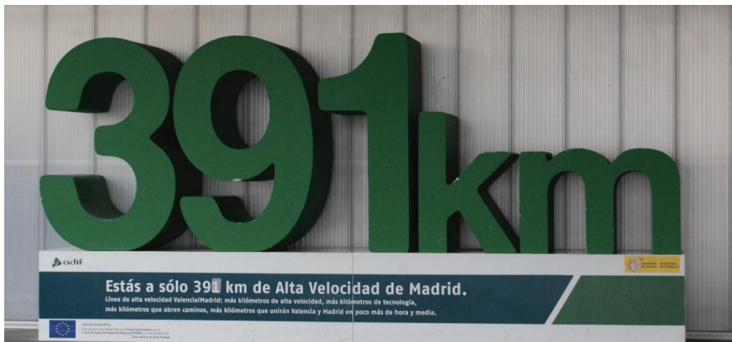
Picture 1- Piece of advertising concerning the AVE Madrid-Valencia, in Joaquín Sorolla station.

The AVE has got a very strong symbolical importance for Valencia. It is the sign that the city joined the very select club of high-speed connected Spanish metropolises, which could be source of economic and demographic attractiveness. That's why the AVE is ubiquitous in the city and its projects. Around the two current railway stations (the Estació del Nord for conventional Iberian Gauge trains, and Joaquín Sorolla station for European gauge AVE), a lot of advertising is present to point out the supposed structuring effects of high-speed for the city.