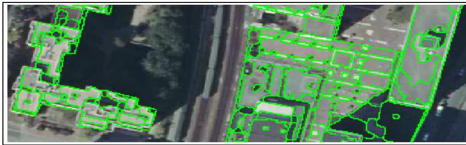
Figure 4 : Example of segmentation

The following figures represent the first results of applying only classification method using Créteil city images. In figure 4 we can see the segmentation of roofs in different regions corresponding to the different classes of materials. After segmentation, a building mask was computed as we can see in figure 5: the BD-ortho associated to its BD-topo. Finally, classification was applied and we get the results in figure 6. In this latter, every color represent the material assigned by AVET classification. These first results present misclassification. For example, as we can see in figure 6, a same slate roof was classified into three materials: slate, flat and shadow area. This is due to the shadow problem.