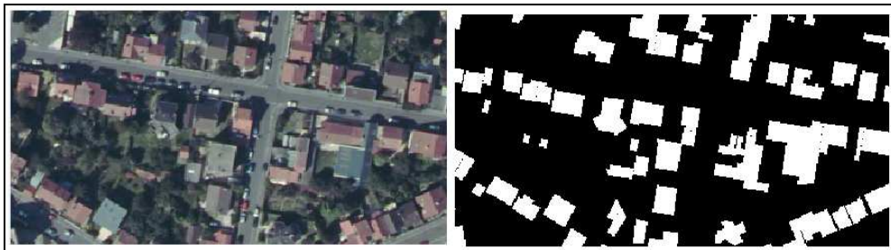
Figure 5: Left: BD-ortho; Right: BD-topo