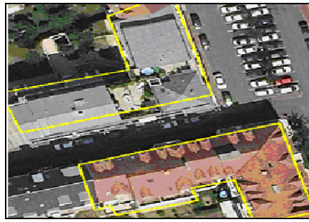
Figure 2 : The building mask don't overlap exactly the limits of buildings in BD-ortho

- Classification : The segmented regions are then classified by the AVET classification tool (Trias-Sanz et al., 2005 and Trias-Sanz, 2006). This tool works in tow steps. First model estimation from training data captured by an operator will be computed: for each class of material (zinc, tile...), an n-dimensional histogram of the radiometry of the class is calculated. Then AVET estimate the best statistical distributions (such as gaussian, laplacian laws but also histograms (raw or obtained by kernel density estimation) to fit to the radiometric histogram. Finally, the best model is selected thanks to a Bayes information criterion (Schwarz, 1978) enabling to choose an alternative between fit to data and model complexity. Secondly classification will be applied: the image can then be classified according to the statistical model of the radiometry of the different classes. Several per pixel and per region classification algorithms are proposed (Trias-Sanz, 2006). In the present work, a 'maximum a posteriori' (MAP) classification algorithm is used because it makes possible to take into account external knowledge as prior probabilities (this method will be described in the proposed solution section). The label c_0(R) given to a region R is its most probable class according to the model previously estimated (and to prior probabilities). Hence, with the MAP algorithm, c_0(R) is the class c that maximizes the following function: