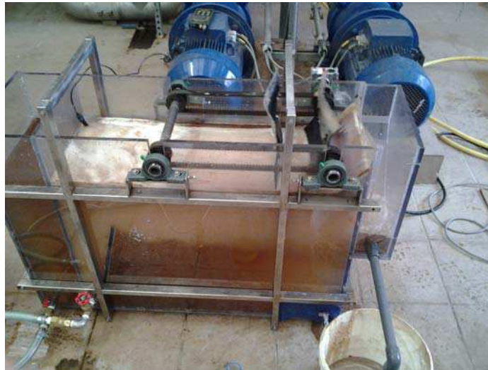
Figure 3: Dissolved Air Flotation (DAF) and Dissolved Ozone Flotation (DOF) unit during tests