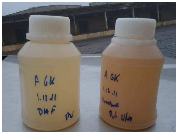
Figure 2: DAF effluent and raw wastewater during tests

The figure 2 shows colour difference between raw wastewater and wastewater after DAF treatment. The next figure (no 3) shows DAF and DOF pilot-test unit during the test in factory.