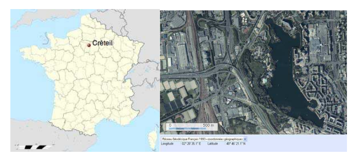
Figure 1: Lake Créteil location (Créteil, France)

Lake Créteil is polymictic with a density stratification lasting from days to weeks during the summer, which impacts the primary production.